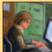
At your office . . .

PROS: Live digital feed and 24/7 Internet access for next six months;